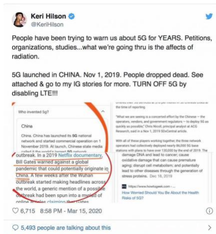
b. Links between 5G towers and COVID-19