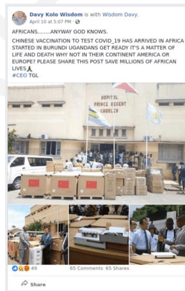
Figure 1. Social media posts collected from AFP Fact Check that were used in the survey