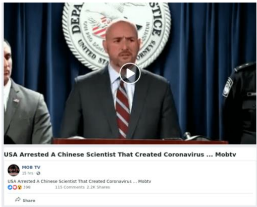
a. Arrest of a Chinese scientist