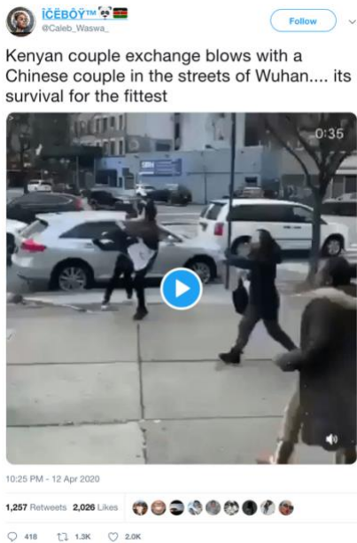
c. Racial tensions between Chinese and Africans